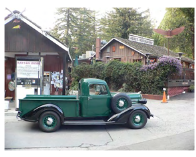
New Year Resolution... Get your car out and tour with your fellow MPOTAC members. Where will we go this year? Plan a tour and tell us!